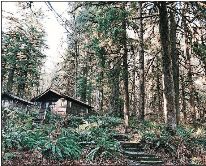
Boulder's Hideaway, LLC

Guests can book any number of accommodations at Smith Creek Village, from tiny cabins to family lodges and a pair of "ranches" that can host up to 75 people overnight. Silver Falls Hospitality is