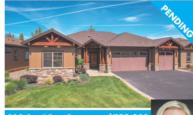
312 Sun Vista Dr. $799,900