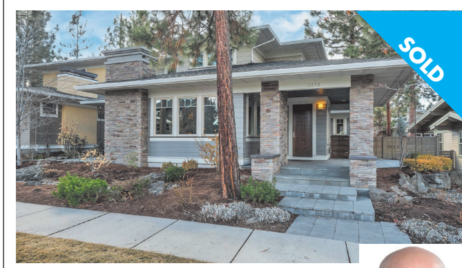
2329 NW Lolo Dr. $995,000