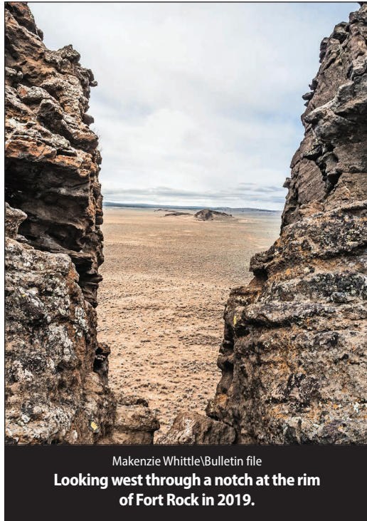
Looking west through a notch at the rim of Fort Rock in 2019.