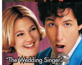
“The Wedding Singer”