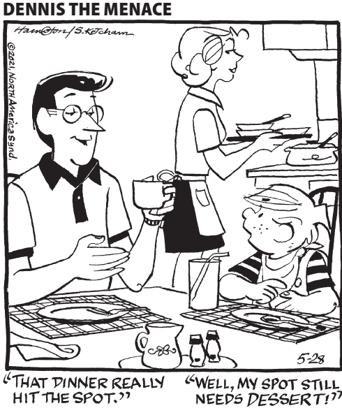
"THAT DINNER REALLY HIT THE SPOT."