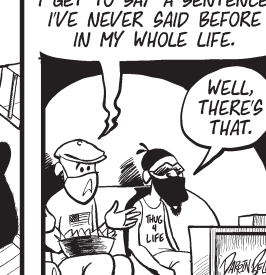
I'M ALWAYS EXCITED WHEN