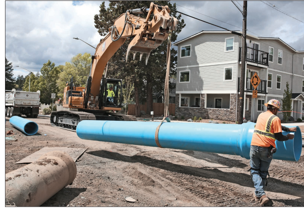
A construction crew works on a new sewer line for the Newport Corridor Improvement Project on NW Newport Avenue in Bend on Monday.