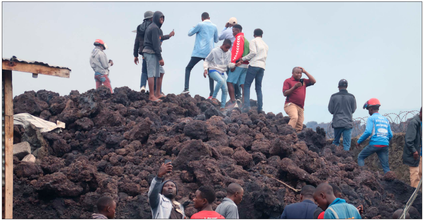
People gather on a stream of cold lava rock following the overnight eruption of Mount Nyiragongo in Goma, Congo, on Sunday.