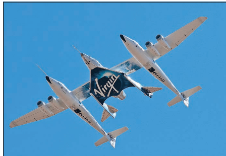
Virgin Galactic's VSS Unity departs Mojave Air & Space Port in California in February for the final time as Virgin Galactic shifts its SpaceFlight operations to New Mexico.

British billionaire and Virgin Galactic founder Sir Richard Branson says the flight and landing bring the roughly 15-year-old venture tantalizingly close to commercial flights for tourists. Virgin Galactic says those flights could begin next year.