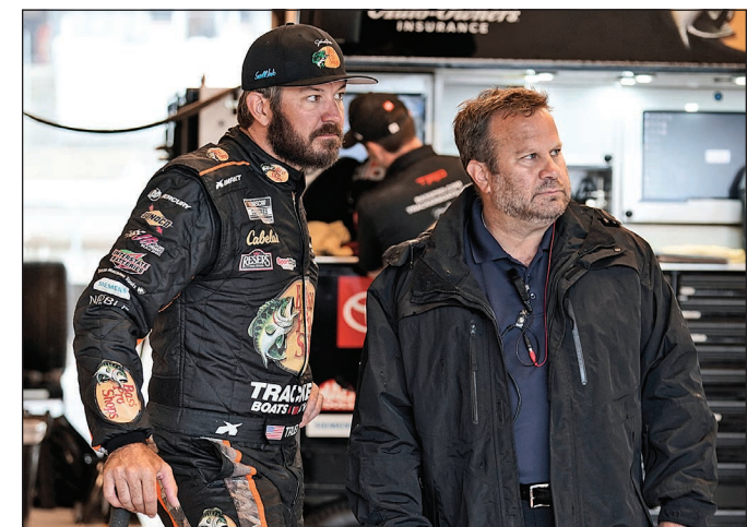
Martin Truex Jr., left, talks to a crew member before practice for Sunday's NASCAR Cup Series race at the Circuit of the Americas in Austin, Texas, on Saturday.

who was fastest in the session. "I hope it rains. For the fans, I think it would be awesome if it rains." Joey Logano was second in practice, ahead of Kyle Larson and Kyle Busch.