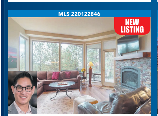
MT BACHELOR VILLAGE $705.000