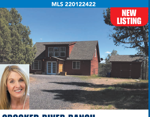
CROOKED RIVER RANCH $379,000