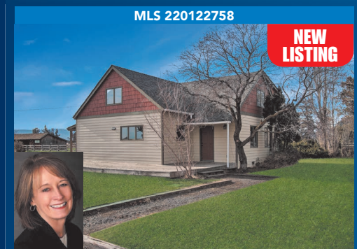
TUMALO FARMS $3,200,000

Patty Dempsey, 541.480.5432 Principal Broker