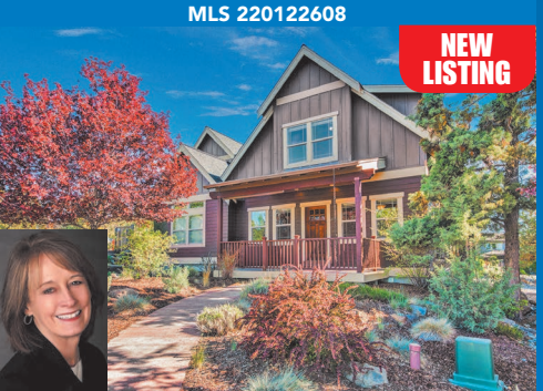
AWBREY POINT TOWNHOME $699,000

Patty Dempsey, 541.480.5432 Principal Broker