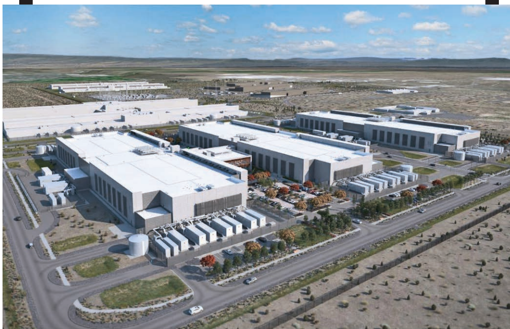
Submitted image, file

An overview of Facebook's Prineville data center campus provided in March.