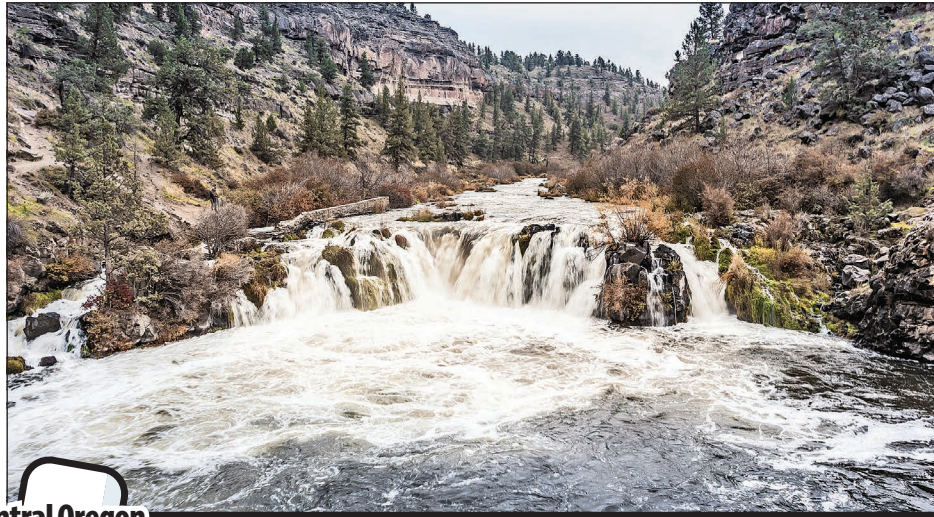
Central Oregon reservoir levels See B9

The following Bureau of Land Management trails are now closed through Aug. 31 to protect nesting raptors: • Millican Plateau OHV Trail System (Route 95 only) • South side of Trout Creek Trail including climbing walls • Cline Buttes Recreation Area (portions of Deep Canyon, Fryrear, Maston, Jaguar Road) • Horny Hollow Trail • Dry River Canyon • For more information visit blm.gov