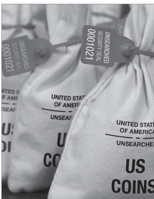
■ UNSEARCHED: Pictured above are the unsearched Vault Bags loaded with nearly 3 pounds of U.S. Gov't issued coins some dating back to the 1800's being handed over to Oregon residents by Federated Mint.

Sealed Unsearched Vault Bags contain nearly 3 pounds of U.S. Gov't issued coins