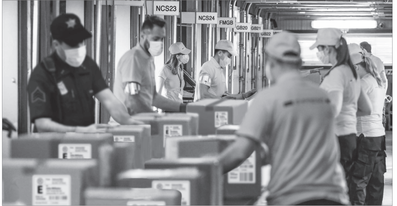
■ OREGON AREA RESIDENTS CASH IN: Pictured above and watched closely by guards are protected U.S. Coin Packages containing the valuable unsearched Vault Bags that everyone will be trying to get. It's hard to tell how much these unsearched bags loaded with rarely seen U.S. Gov't issued coins could be worth someday. That's because each Vault Bag is known to contain nearly 3 pounds of U.S. Gov't issued coins some dating back to the early 1800's, so you better believe at just $980 these Unsearched Vault Bags are a real steal.