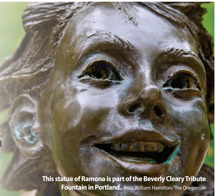
This statue of Ramona is part of the Beverly Cleary Tribute Fountain in Portland.

The resolution was to be sent to Cleary's family, according to a press release from Merkley's office. "We are so lucky," Merkley said, "that her legacy endures in the stories she left behind."