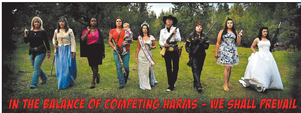
IN THE BALANCE OF COMPETING HARMS - WE SHALL PREVAIL

■ Reporter: 541-383-0304, mwhittle@bendbulletin.com