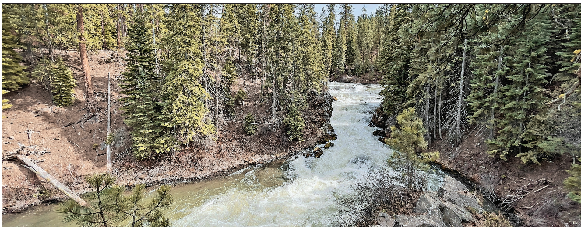
Benham Falls as seen from the viewing area near the west trailhead.