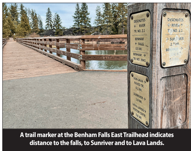
A trail marker at the Benham Falls East Trailhead indicates distance to the falls, to Sunriver and to Lava Lands.

Getting there: To the Benham East Trailhead, from Bend travel south on U.S. Highway 97 for about 11 miles then turn right at Lava Lands, fol-