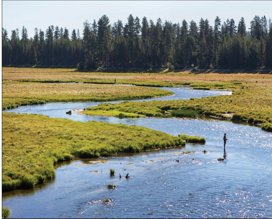
A angler carefully watches his line for a bite while fishing a section of water near Sheep Bridge Campground at Wickiup Reservoir in August 2020.