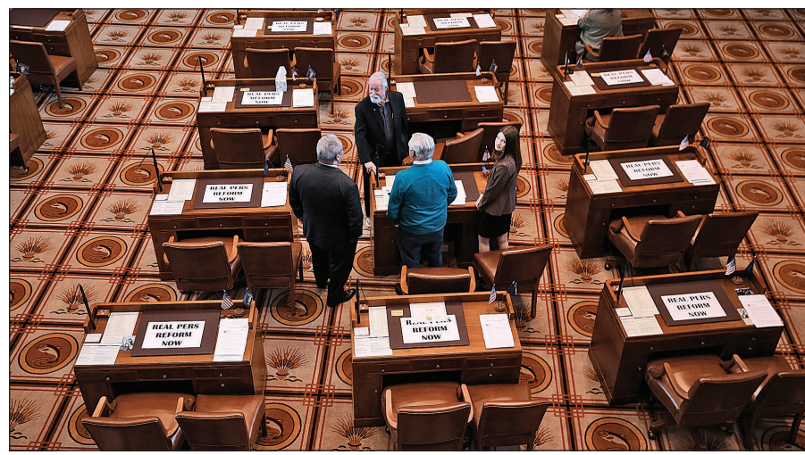
A group including three Democratic senators stand among the empty desks of Republican senators during a Senate floor session at the Oregon Capitol in Salem in 2019.

The harassment didn't stop there. Hansell said his constituents had been contacted to gather signatures to recall him, and a Molalla resident filed a prospective