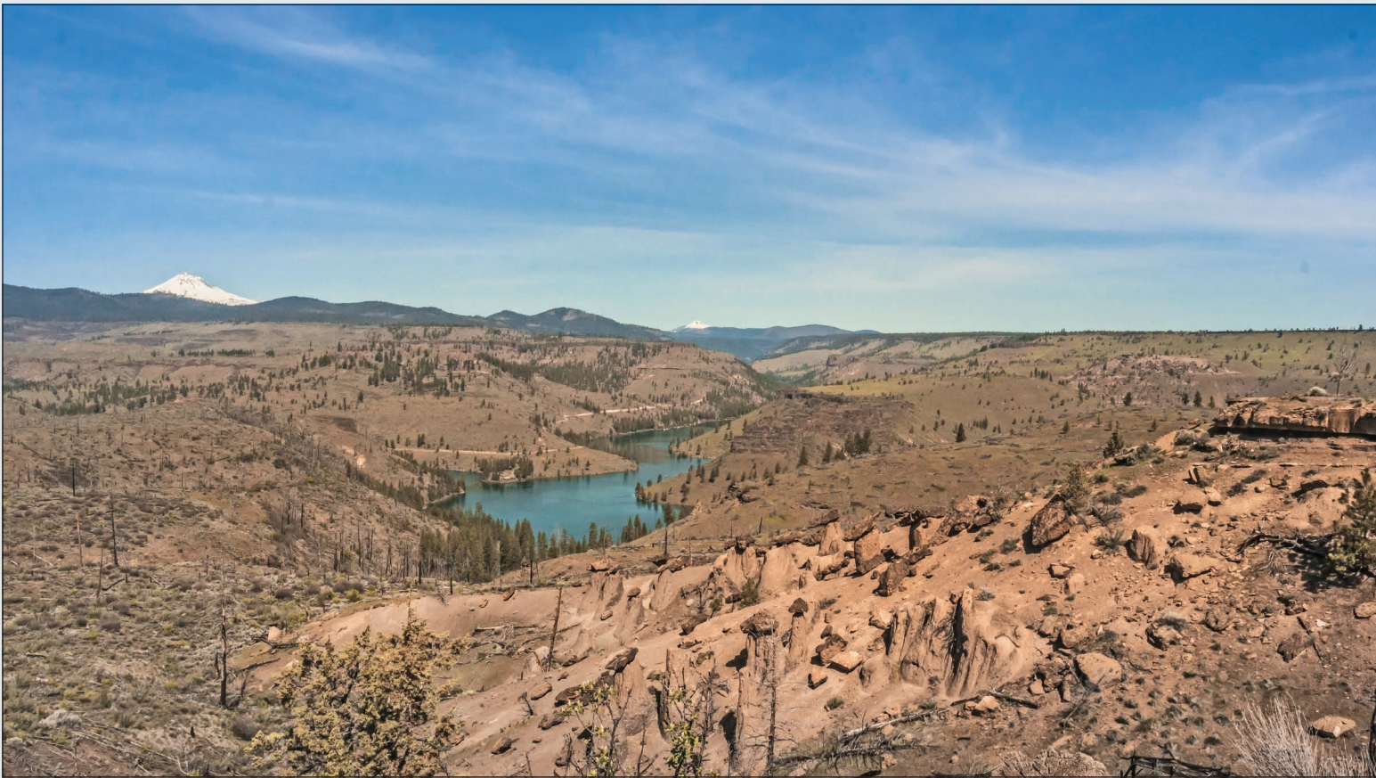
Mount Jefferson in the distance with the Metolius River arm and the Balancing Rocks at Lake Billy Chinook.