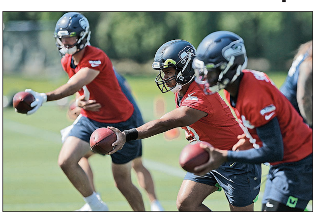
Seattle Seahawks quarterback Russell Wilson, center, drops back to pass next to backup quarterbacks Paxton Lynch, left, and Geno Smith, right, during training camp in 2019 in Renton, Washington.