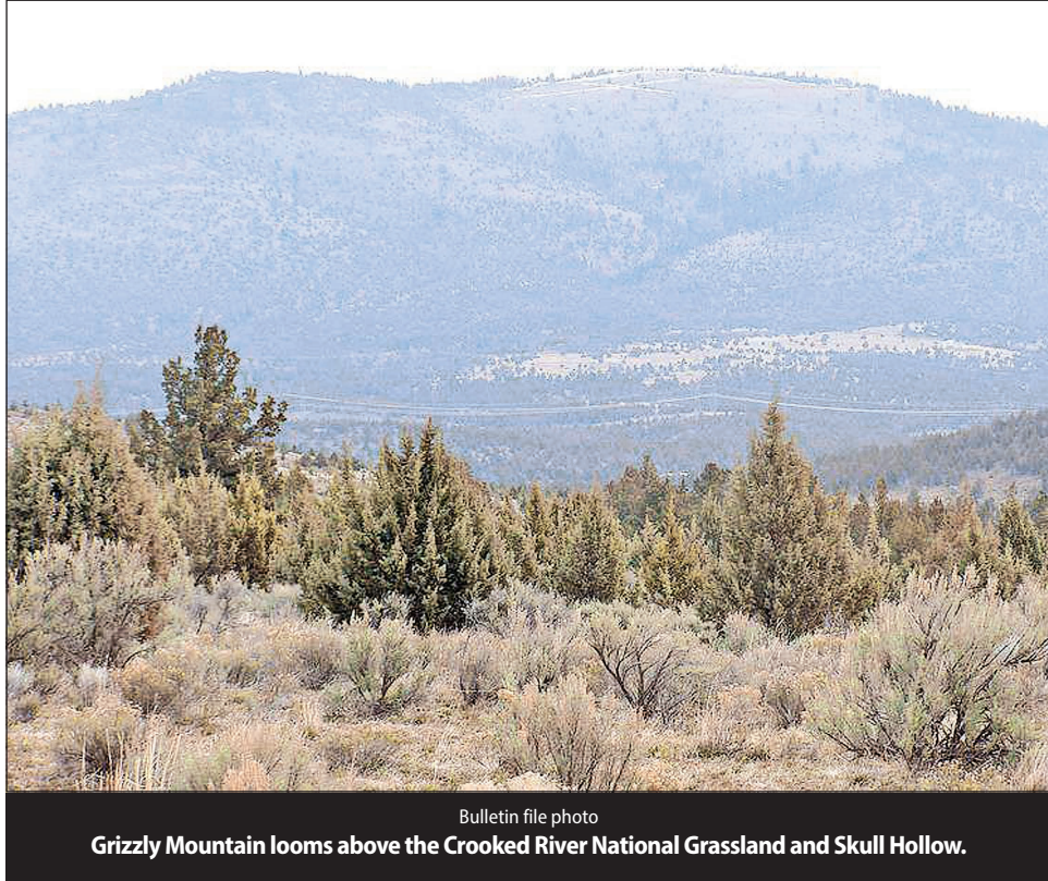
Grizzly Mountain looms above the Crooked River National Grassland and Skull Hollow.