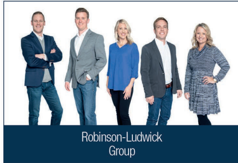
Robinson-Ludwick Group 4+ members, Minimum of $1,500,000 GCI or 200 units