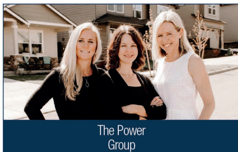
The Power Group 4+ members, Minimum of $600,000 GCI or 90 units