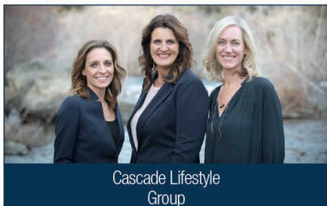
Cascade Lifestyle Group 4+ members, Minimum of $750,000 GCI or 120 units