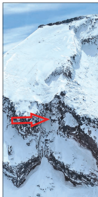
Deschutes County Search and Rescue A climber on the north side of South Sister was rescued Monday. The area is marked above.

Undergraduate students at Oregon State University-Cascades will see tuition rise next school year — but that increase will be smaller for returning