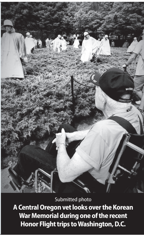
A Central Oregon vet looks over the Korean War Memorial during one of the recent Honor Flight trips to Washington, D.C.

Online: Applications for veterans, guardians and volunteers are available at: www.honorflightofcentraloregon.org/board-portal