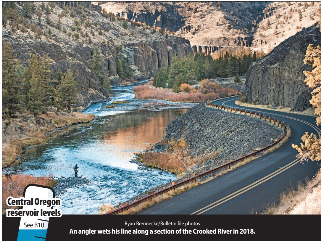
Central Oregon reservoir levels See B10

For a full list of conditions updated regularly, please visit centraloregonexplore.com .