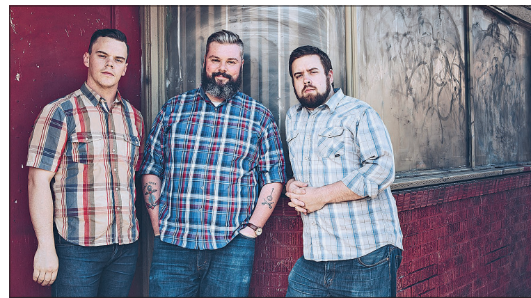
The Junebugs will perform via livestream April 15.

Artist Reception Friday, April 2 | 4-7pm We are returning to monthly openings, while continuing to follow state guidelines for Covid safety. Come celebrate our first solo show of the year with us!