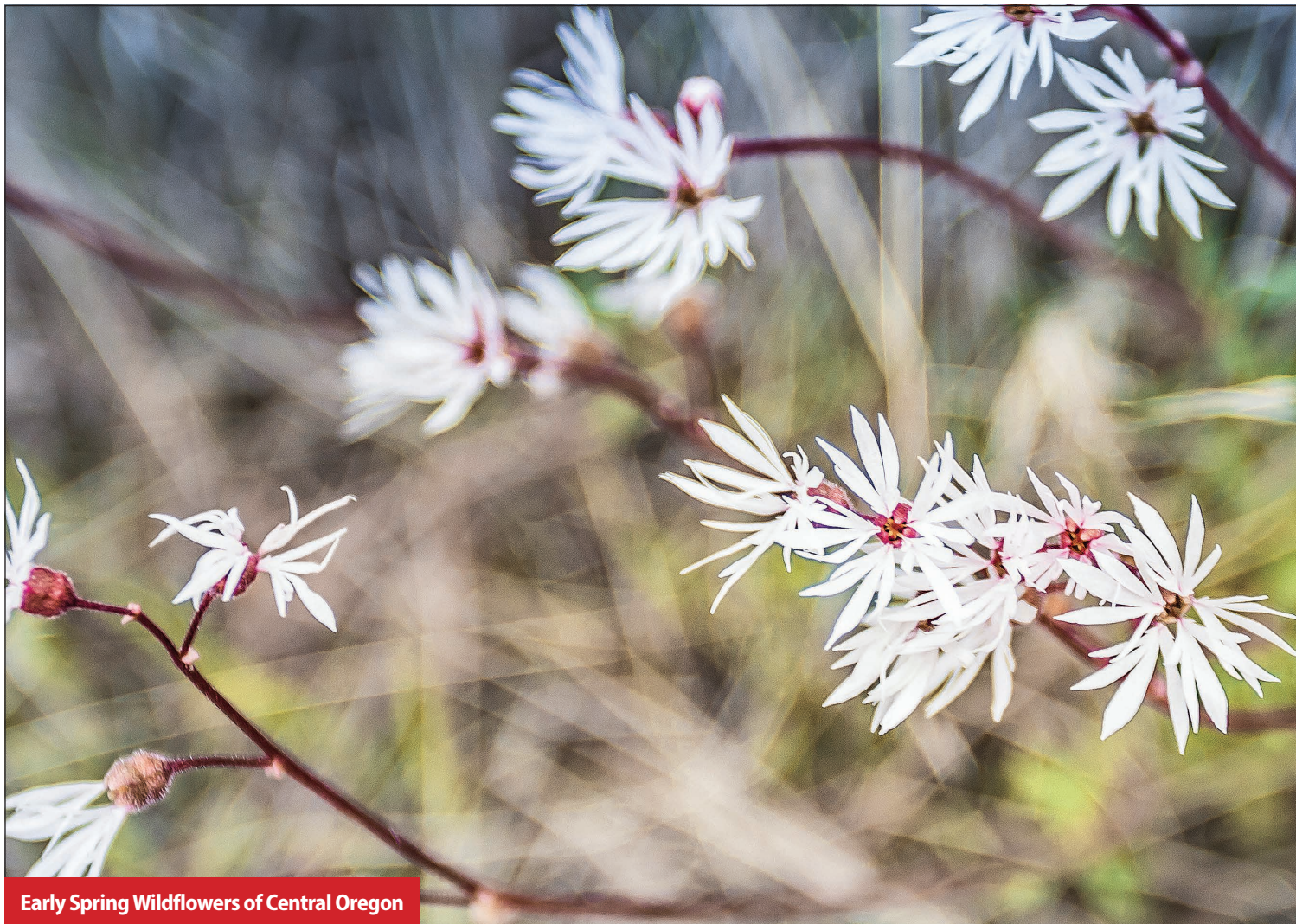
Early Spring Wildflowers of Central Oregon