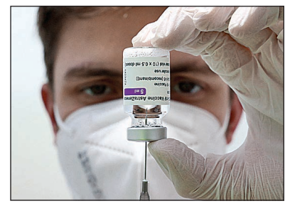
Medical staff prepares a syringe from a vial of the AstraZeneca coronavirus vaccine in Germany on Monday. The vaccine is approved in 70 countries, but not yet in the United States.