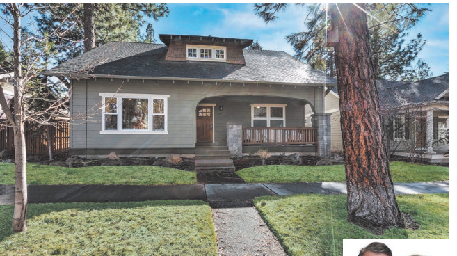
2565 NW Lemhi Pass Dr. $979,900