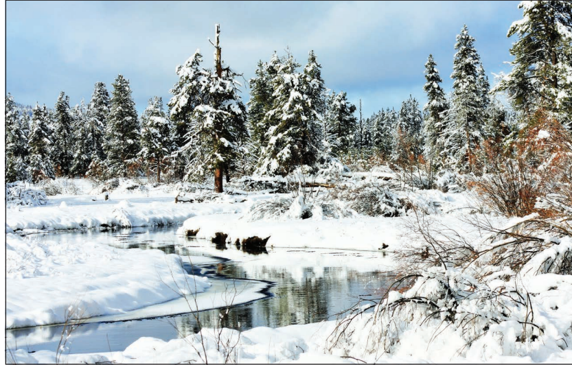
Winter scene on the Little Deschutes River in La Pine in 2016.