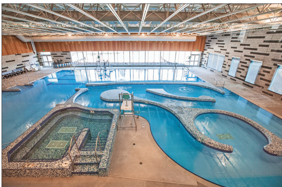
The new Larkspur Community Center includes a 5,000-square-foot warm-water pool with a current channel, bubble benches, soft walk bottom and an adjacent hot tub.

The Bend Park & Recreation District's newly expanded Larkspur Community Center includes a 5,000-square-foot warm-water pool with a current channel, bubble benches, soft walk bottom, and an adjacent hot tub.