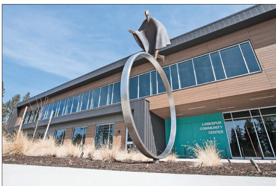
The front entrance of Larkspur Community Center, located on Reed Market Road and 15th Street in Bend, on Wednesday.