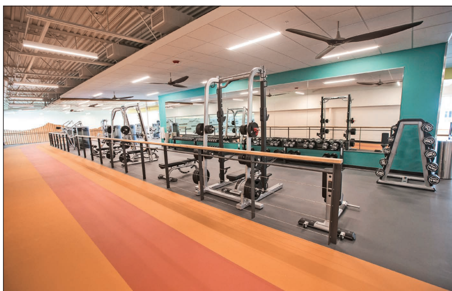
The indoor track and workout area at Larkspur.

It is located at 1600 Reed Market Road and can be reached for reservation by calling 541-388-1133.