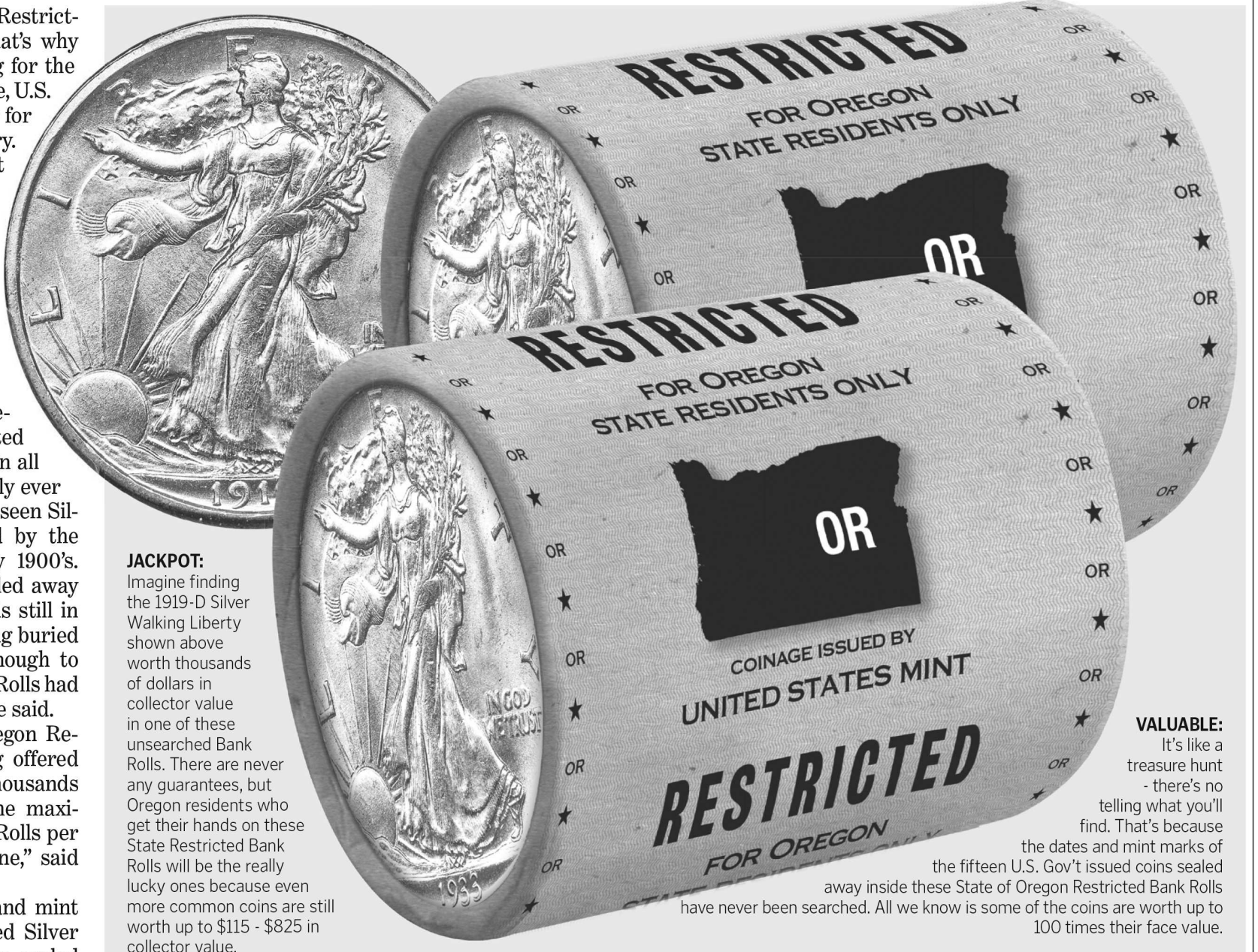
JACKPOT: Imagine finding the 1919-D Silver Walking Liberty shown above worth thousands of dollars in collector value in one of these unsearched Bank Rolls. There are never any guarantees, but Oregon residents who get their hands on these State Restricted Bank Rolls will be the really lucky ones because even more common coins are still worth up to $115 - $825 in collector value.

"We know the phones will be ringing off the hook. That's why hundreds of Hotline Operators are standing by to answer the phones beginning at 8:30am this morning. We're going to do our best, but with just 2 days to answer all the calls it won't be easy. So make sure to tell everyone to keep calling if all lines are busy. We'll do our best to