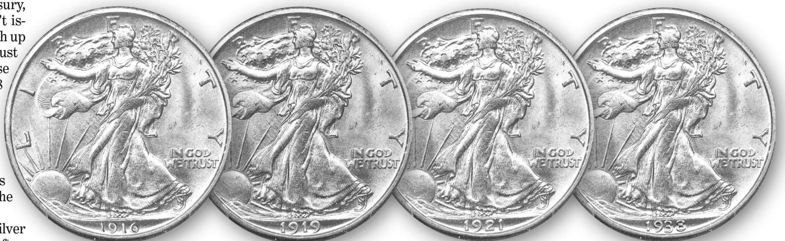
1916-P Mint: Philadelphia Mintage: 608,000 Collector Value: $55 $265

IMPORTANT: The dates and mint marks of the U.S. Gov't issued Silver Walking Liberties sealed away inside the State of Oregon Restricted Bank Rolls have never been searched. Coin values always fluctuate and they are never any guarantees, but any of the scarce coins shown below, regardless of their value that residents may find inside the sealed Bank Rolls are theirs to keep.