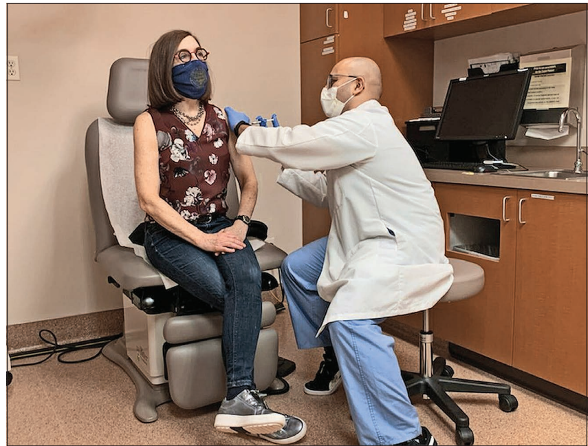
Gov. Kate Brown receives the Johnson & Johnson COVID-19 vaccine at a rural health clinic. “I want to reassure Oregonians that they should feel confident taking any of the three vaccines available to protect themselves and their loved ones,” Brown said.