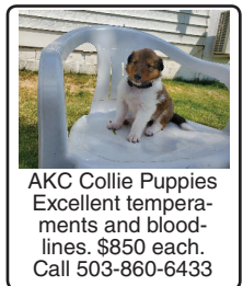
AKC Collie Puppies Excellent temperaments and bloodlines. $850 each. Call 503-860-6433

AKC REG. GERMAN SHORTHAIRED POINTER PUPS, 4 females, liver patched & ticked, & liver patched white & ticked, papered, purebred, docked, dewclaws removed, 1st shots, wormed, National Championship bloodlines, over 100 National Champions & Champions in 6-generation pedigree, both parents OFA certified for hips, just born February 15, $1100 each. Training advice available. Call 509-981-5443