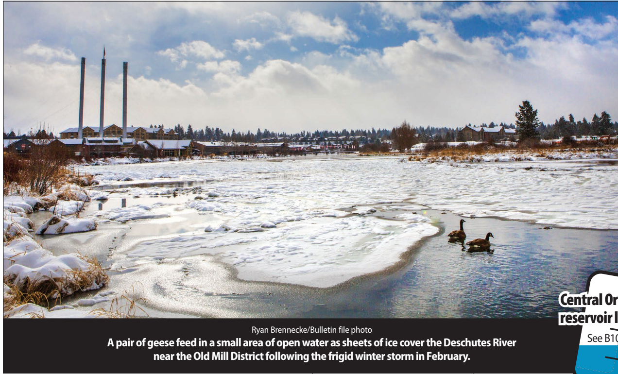
A pair of geese feed in a small area of open water as sheets of ice cover the Deschutes River near the Old Mill District following the frigid winter storm in February.