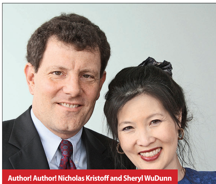
Author! Author! Nicholas Kristoff and Sheryl WuDunn

Handling Common HOA Nuisances: Join a Zoom presentation while speakers help us understand what a nuisance is. Determining the best resolution for various types of nuisances, when a nuisance is best resolved by the owner and much more.; 4:30-5:30 p.m.; $20; online; go.evnt.com/744016-1 or 541-719-8224.