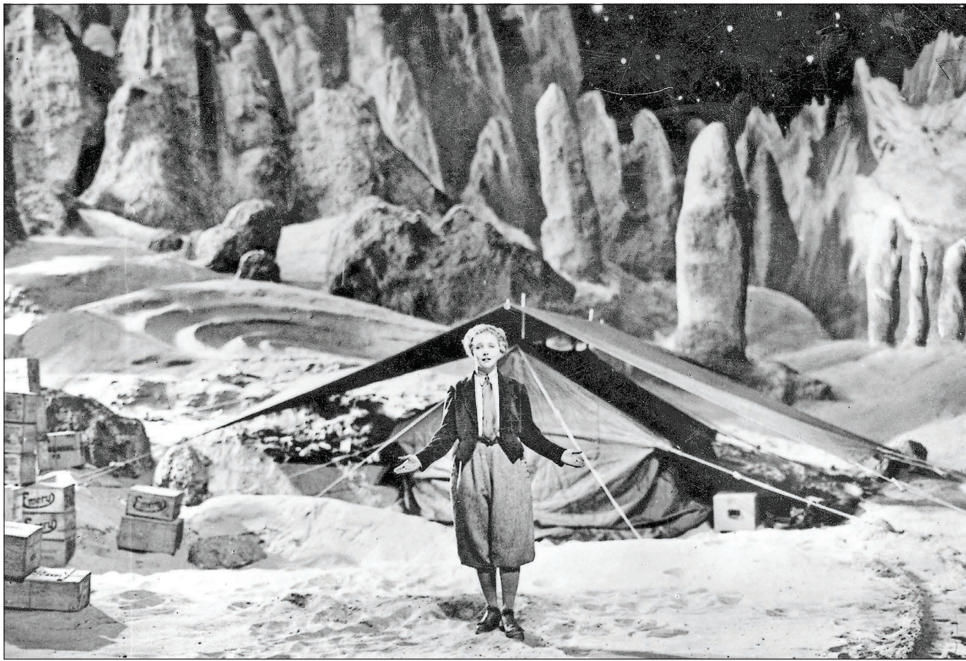
Gerda Maurus in a scene from "Woman in the Moon" (1929).