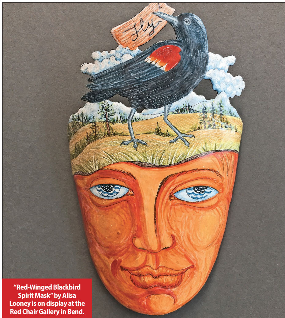
"Red-Winged Blackbird Spirit Mask" by Alisa Looney is on display at the Red Chair Gallery in Bend.

Art Adventure Gallery: Featuring works from local gallery artists; works available to view online and in person by appointment only; 185 SE Fifth St., Madras; artadventuregallery.com or 541-475-7701.