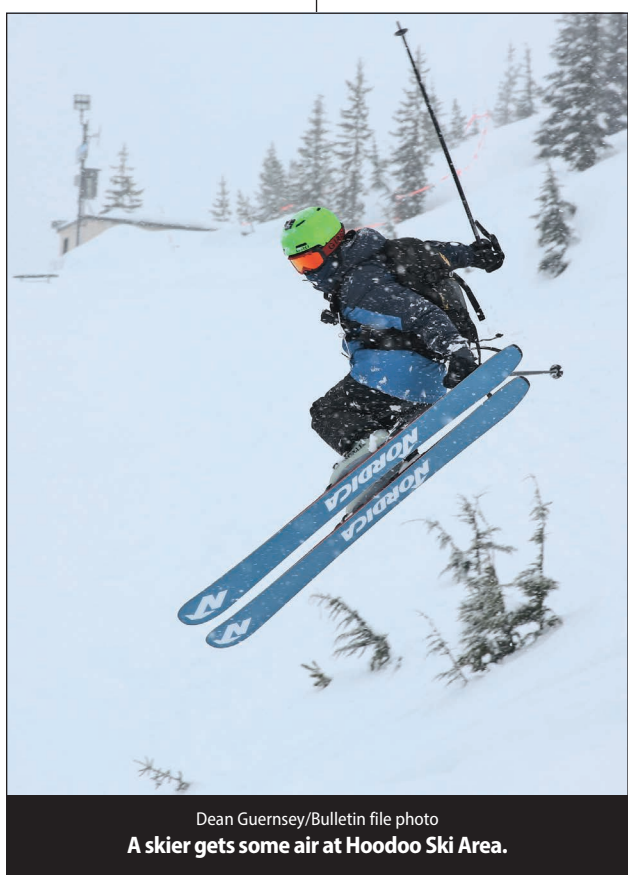
A skier gets some air at Hoodoo Ski Area.