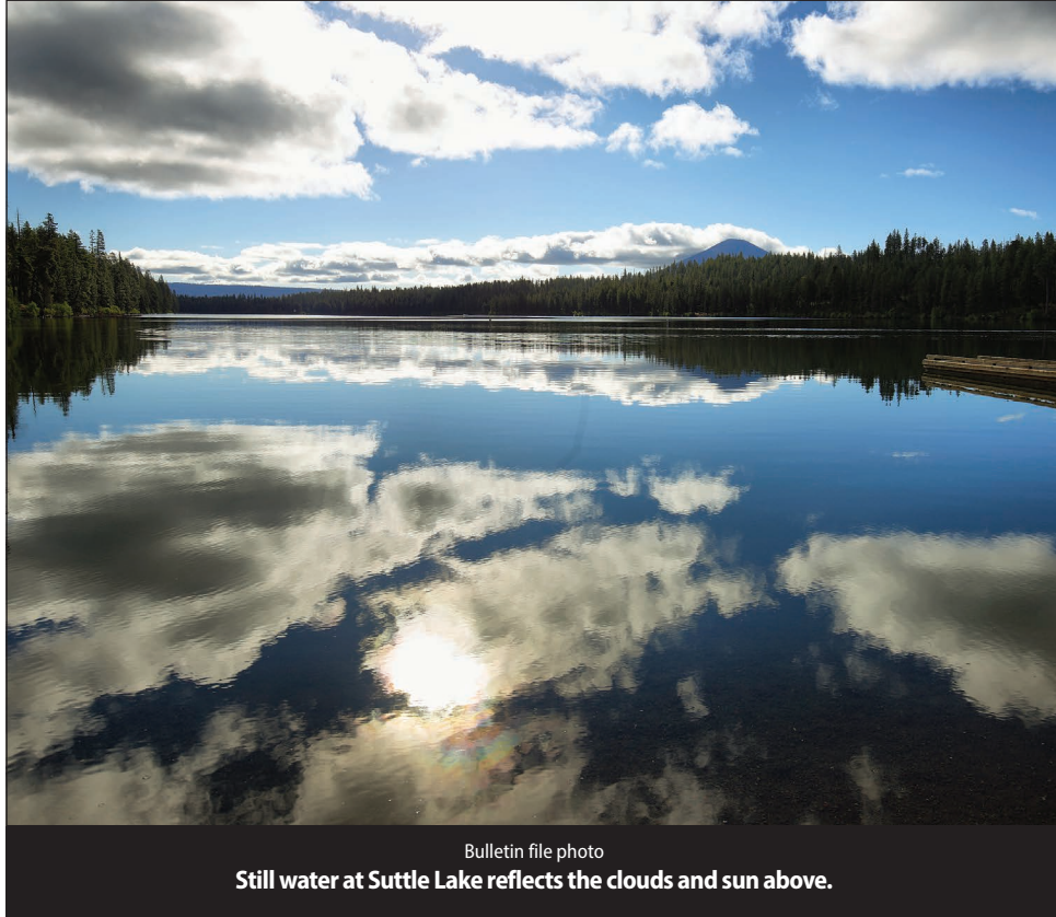
Still water at Suttle Lake reflects the clouds and sun above.