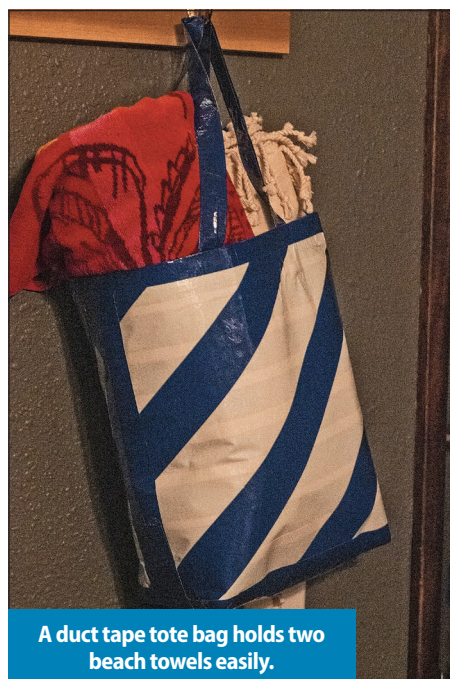
A duct tape tote bag holds two beach towels easily.