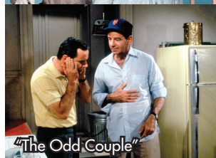
“The Odd Couple”