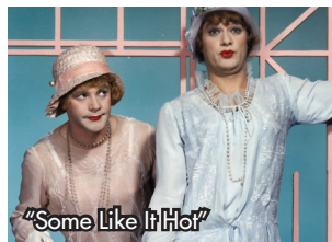
“Some Like It Hot”