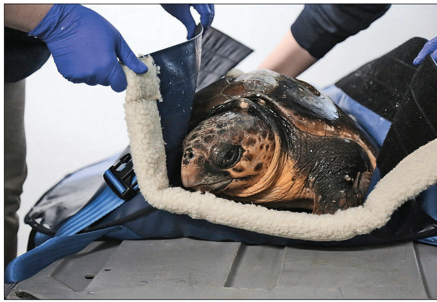
Oregon Coast Aquarium

Rehabilitating a cold-stunned turtle is not a quick endeavor. The aquarium's veterinarian staff began a series of increas-