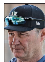
Scott Servais in 2019.