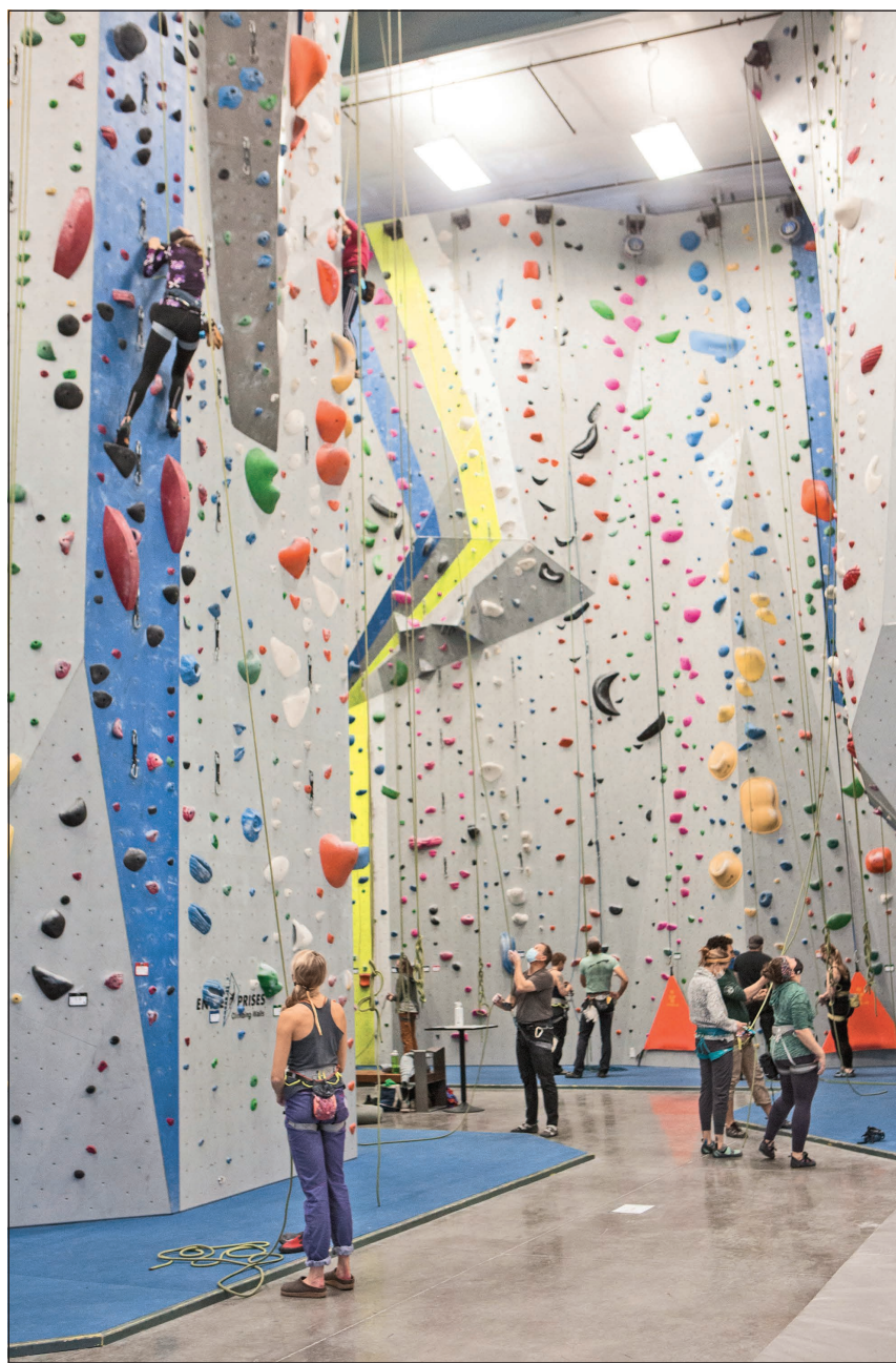
Visitors climb at the Bend Rock Gym on Thursday.