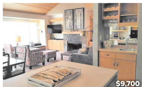
6990 Robin Court, Redmond Stav-cation, vacation, vou choose, Eagle Crest Fractional, 10 weeks per year!