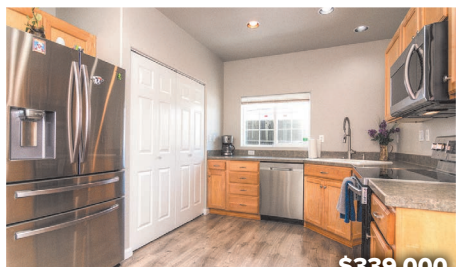
327 NW Elm Avenue, Redmond 2 bed, 1 bath, 940 sq. ft. Move in ready! Fresh interior paint.

KRISTIN PROSSER, BROKER 541-420-4668 / kristinre@kristinprosser.com