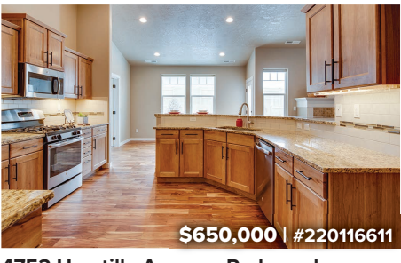
4752 Umatilla Avenue, Redmond Single level, open floor plan with 5 bed. Great location on 0.21 acres. KARIANN BOX/ AUDREY COOK, BROKERS