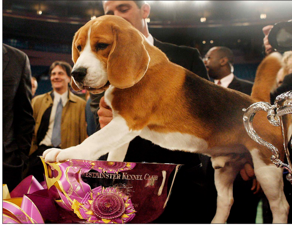
Uno, a 15-inch beagle, poses with his trophy after winning the 2008 Best in Show at the 132nd Westminster Kennel Club Dog Show at Madison Square Garden in New York. Beagles had always been in the Westminster doghouse. No matter how cute, poor ol' Snoopy had never, ever won the grand prize. Bow-wow bummer.

Winning wasn't on this big guy's mind when he romped around the ring in the 2016 working group competition. Naw, he only wanted to gnaw at his handler's pocket, trying to scarf up