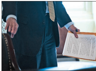
Sen. Bill Cassidy, R-La., holds documents in the Senate Reception Room on Friday.

On Friday, however, Cassidy held a document in public view that appeared to indicate he is ready to ac-