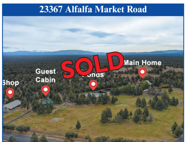
NE Bend, 2 homes, 13+ acres, 4000 sq. ft. shop!