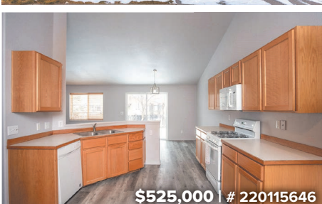
19990 Powers Road, Bend SW Bend single-level, 3 bed, 2 bath, 1364 sq. ft. lot! LEVISON GROUP, BROKER