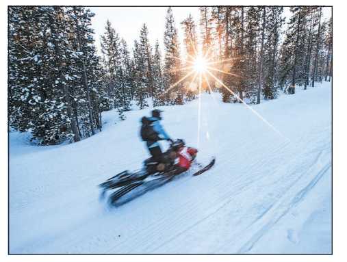
The sun begins to set Jan. 23 as a snowmobiler rides back to the Kapka Butte Sno-park.