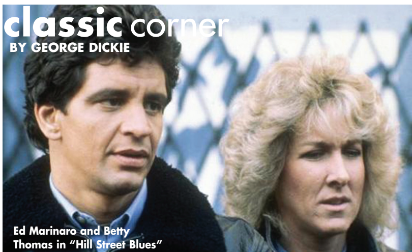
Ed Marinaro and Betty Thomas in "Hill Street Blues"