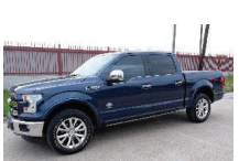
2015 Ford F-150 4x4 Supercrew King Ranch with 58k miles, fully loaded with $13210 sale price. All Info: er946937@gmail.com